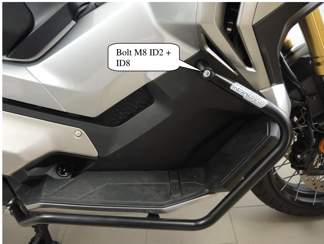
Bolt M8 ID2 + ID8