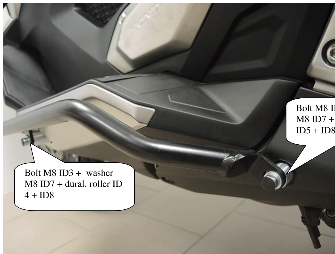
Bolt M8 ID6 + Washer M8 ID7 + dural. roller ID5 + ID8