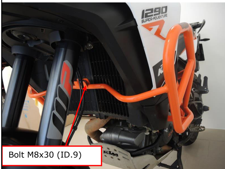
Bolt M8x30 (ID.9)