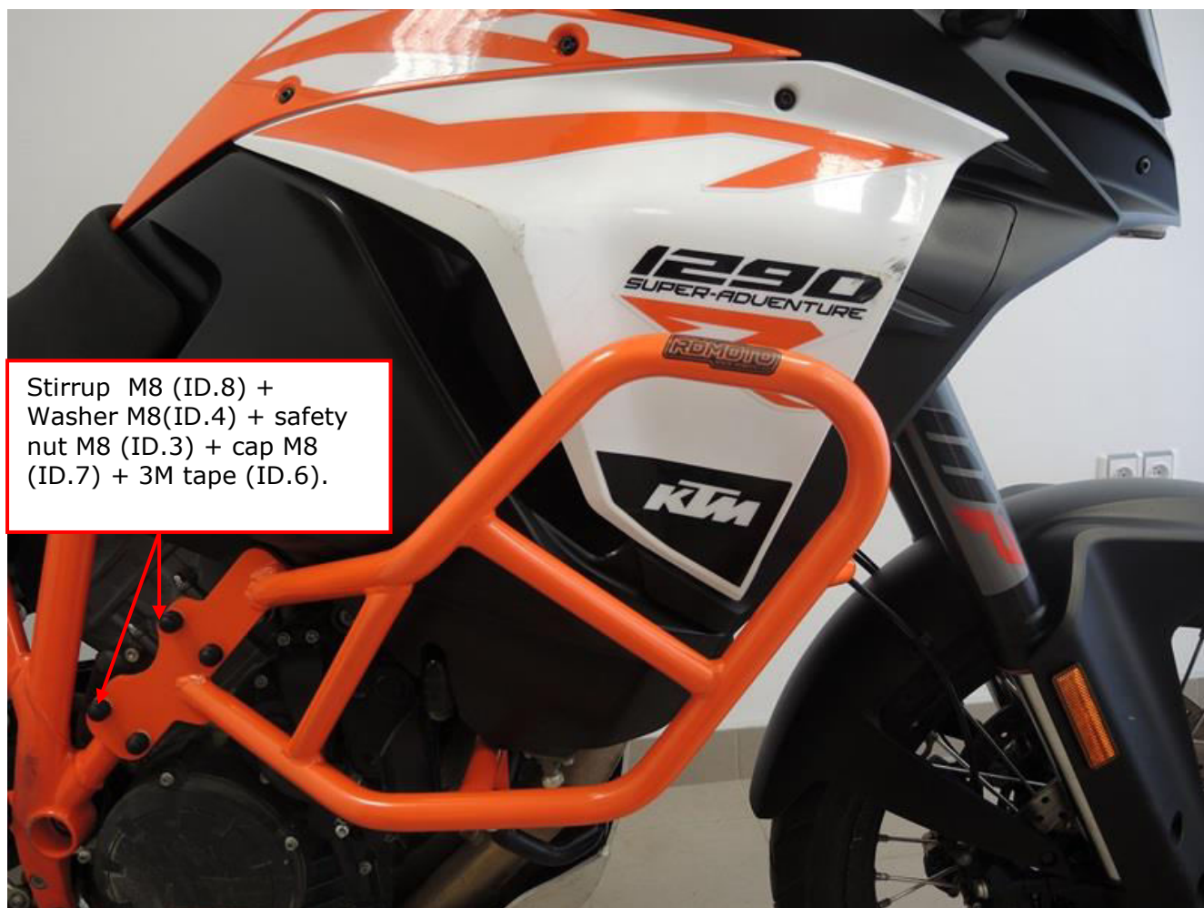
Stirrup M8 (ID.8) + Washer M8 (ID.4) + safety nut M8 (ID.3) + cap M8 (ID.7) + 3M tape (ID.6).